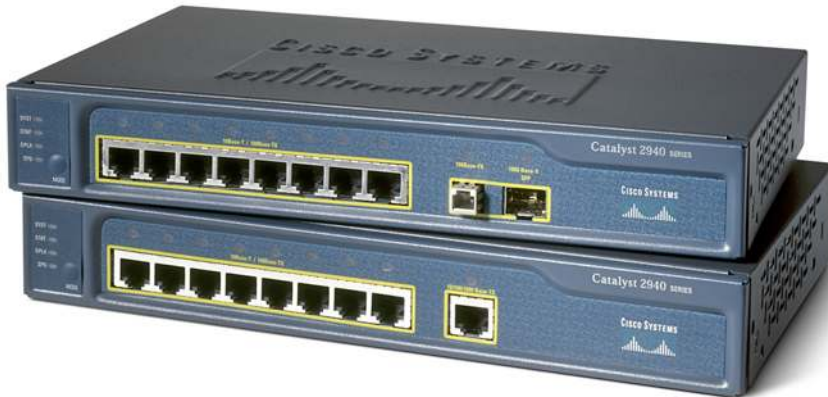
Figure 1. Cisco Catalyst 2940 Series Switches

The Cisco Catalyst 2940 Series is extremely easy to set up and configure via Cisco Express Setup, a simple Web-Based setup utility. For more advanced configuration and ongoing management, the Cisco Catalyst 2940 Series has a console port and supports remote management protocols such as Telnet, Simple Network Management Protocol (SNMP), as well as Cisco Network Assistant, which is a free PC-based network management application. Combine this with the rich functionality of Cisco IOS® Software, and these switches provide comprehensive functionality and manageability for classrooms, conference rooms, or other very small workgroup environments. In addition, the Cisco Catalyst 2940 Series is supported by a limited lifetime warranty. The Cisco Catalyst 2940 Series switches provide the lowest total cost of ownership in their product class with their durable design, enhanced security, simple installation and management, and award-winning Cisco support.